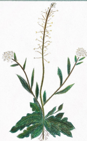
Borsa di pastore Capsella bursa-pastoris