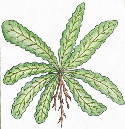
Lingua D'asino Hypochaeris radicata