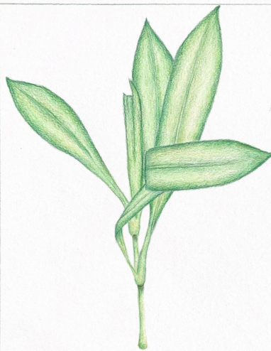
Silene Rigonfia Silene vulgaris