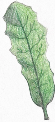
Lingua D'asino Hypochaeris Radicata