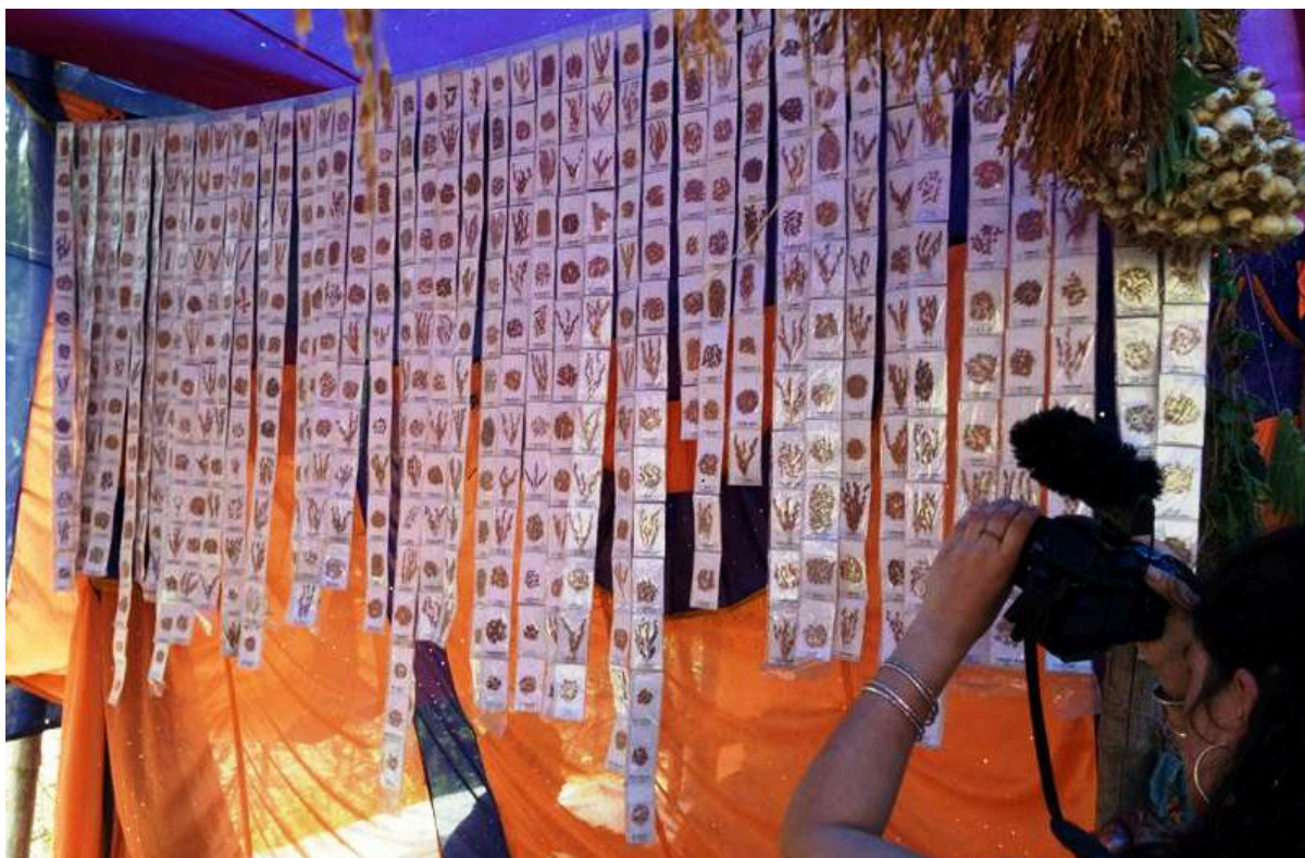
Rice varieties at Navdanya Orissa Seed Bank

Below is a selection of excerpts from over 30 years of Navdanya reports and experience , as well as the direct result of collaborative work with partners in Asia which showcase a part of the complex story of not only the capture of rice seed diversity, but the repercussions of the erasure of traditional cultivation and knowledge systems.