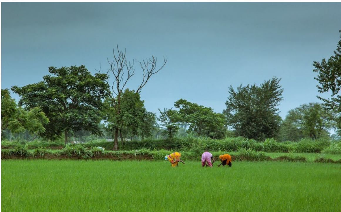
"Chhattisgarh rice planting"