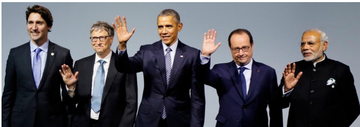
Gates and world leaders at the climate change conference in Paris, 2015.

This technological solutionism mentality is apparent in all of the Bill and Melinda Gates Foundation's (BMGF) initiatives which, by their nature, end up denying real solutions to the climate crisis. These initiatives, grants, and development programs cover a vast area – such as food, agriculture, seed, health, climate change, education, media, infrastructure, and energy as shown in Navdanya International's Gates to a Global Empire report 3 – and weave a complicated web of international power and influence to ensure specific interests. With the weight of investment capital held by both the Gates Foundation Trust and their personal wealth, in conjunction with their bought public media platform, Bill and Melinda Gates set the agenda across these different sectors with very little to no accountability. In the end, this works to align public opinion with private company investments, and international and state policy, to open up new markets through policy alignment and state co-investment in the name of 'development'.