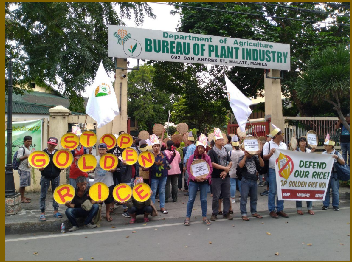
A demonstration against Golden Rice, Manila

The worsening land-grabbing and land conversion cases, liberalization of agricultural commodities and increasing control of corporations over agriculture and food, however, are preventing farmers and their communities from having access to these safe and nutritious foods. In developing countries, the challenges described above remain the main culprit of food insecurity and malnutrition. Both the development of biofortified crops like Golden Rice for solving health issues and corporate led projects in agriculture as ways to ensure food security represent a worrisome push for top-down and anti-diversity approaches to food and health that will ultimately undermine people's capacities to strengthen their local food systems. By emphasizing dependence on just a few market-based crops biofortification actually promotes a poor diet with little nutritional diversity