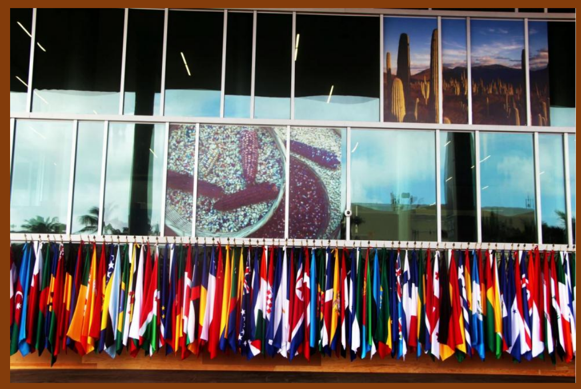
COP13 - Convention on Biological Diversity.

Gates, and his push to digitalise every aspect of life, undermines the CBD and the FAO Seed Treaty through Digital Sequence Information (DSI)<sup>5</sup> and patents based on digital genome mapping.