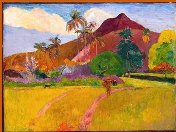
Paul Gauguin, (Tahitian Landscape), 1891