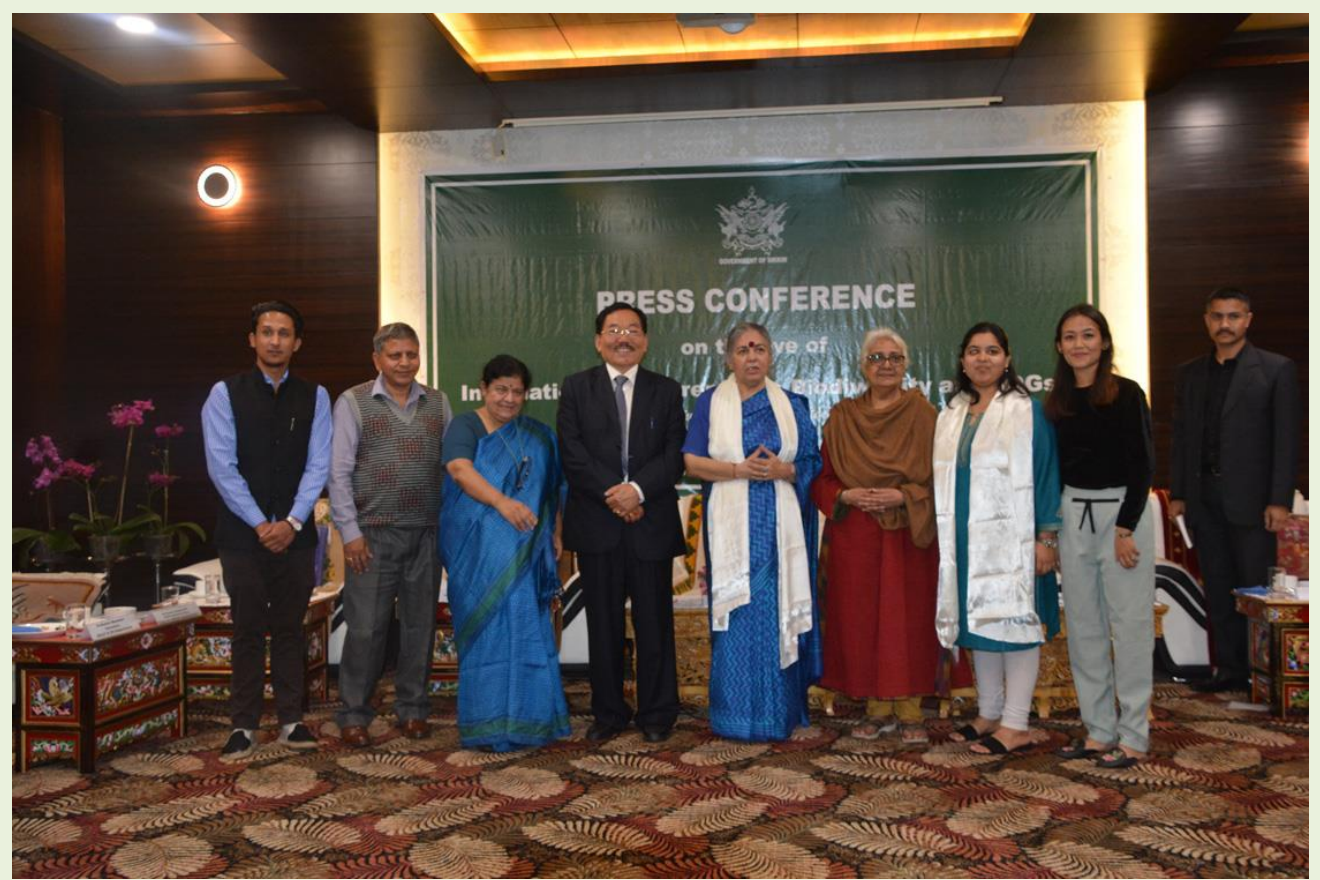
Photo: Navdanya - International Conference on Biodiversity and SDGs, May 2018 Gangtok

Transition to organic production isn't the kind of policy that can be implemented in the short-term, but requires many years and strong political will. The Sikkim project began in 1994, but tangible results were achieved in 2003, when the Chief Minister approved a resolution that contained a commitment to make Sikkim a 100% organic state. At the time, the process of implementing certification took another ten years. Today Sikkim can boast the highest human development index levels in India, and this fact in particular demonstrates the success of its journey. As the Chief Minister Pawan Kumar Chamling declared:"Since the resolution was announced at the Legislative Assembly to convert the entire state to organic we have met with various resistance from the opposition and from the farmers themselves, but we have continued with determination. We are pleased that others want to take inspiration from our work, such as Kerala and other states in north-east India. To achieve these results we have always been at the forefront with various public policies, such as waste management, protection of forests, glaciers and climate, as well as education. You are curious to know our experience, but we also have a great interest in knowing other experiences in this field in other parts of the world. A 100% organic world is possible and there is no reason why farmers, communities and institutions should not continue to engage in this direction".