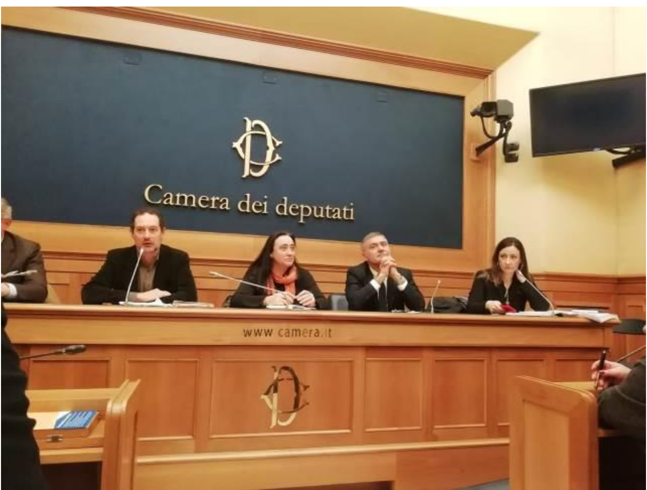
#Stop Ceta Press Conference